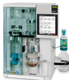
KjelMaster K-375 Steam distillation and titration